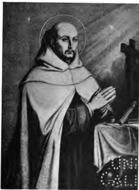
St. John of the Cross